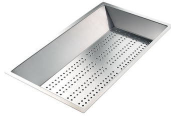
Stainless steel perforated tray